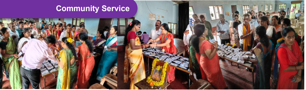
28 th Sep – Spectacle Donation at Kukkehalli. 107 spectacles were donated by RC Manipal to the beneficiaries of the free eye check up camp held on 21.09.2025